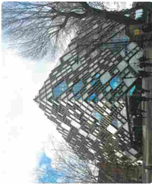
University of Sheffield new Engineering Building – 'The Diamond'